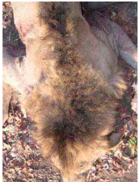
Fig 2. Mane from the Top