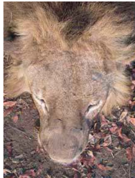
Fig 3. Face from the Top