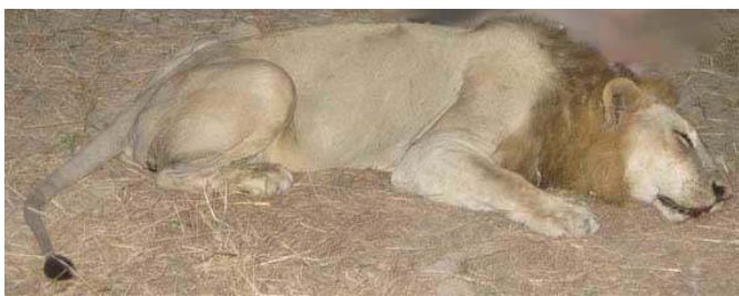
Figure 1. Whole Body from the Side