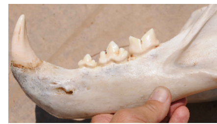
Fig 9a,b. Jaws from side