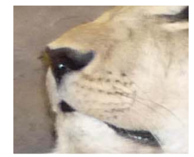
Fig 11a,b,c. Whiskers! Both Sides + Front