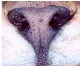
Fig 5. Nose (not too close!)