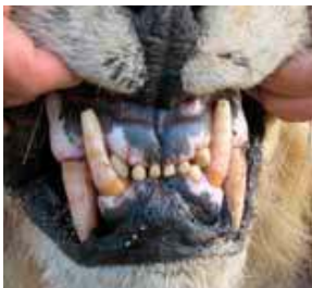
Fig 6. Teeth (before cleaning)

Date: Client Name: GMA: PH Name: Total Length Nose to Tail Tip: Length of Tail only: Height at Shoulder: