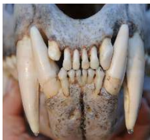
Fig 7. Teeth (after cleaning)