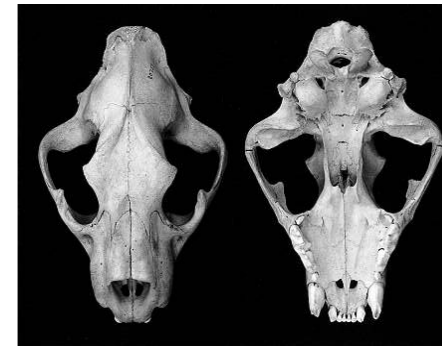
Fig 10a,b. Skull above & below