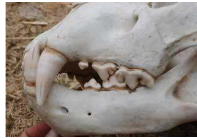
Fig 8a,b. Teeth each side