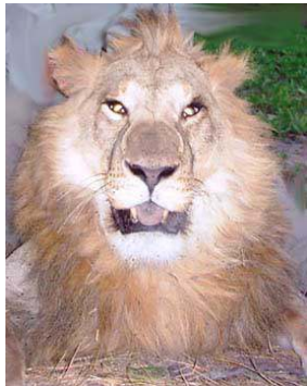
Fig 4. Face & Chest